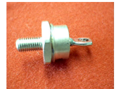
1N4510 Standard Rectifier (trr More Than 500ns)